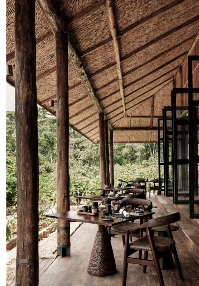
Gorilla Forest Lodge: Papyrus + Banana Fibre | Ceiling Cladding